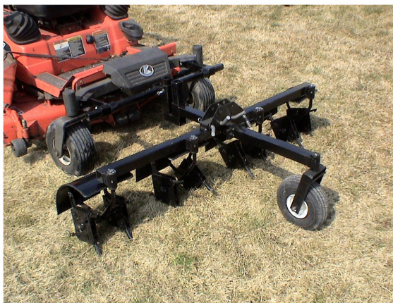
Optional Clamp-on Mount Shown